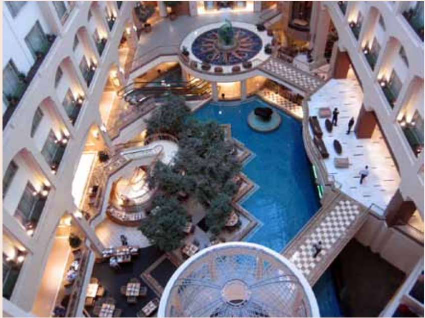
The conference venue, the Grand Hyatt in Washington DC.

Other activities that I attended and some that I simply didn't have the energy or time to attend included: visits to various embassies, walking tours, minyans (both Orthodox and Egalitarian), PC and MAC workshops, SIG breakfasts and lunches, dinners, theatre performances, concerts and more than 25 films.