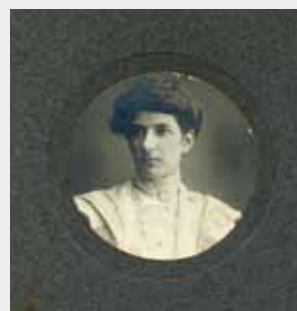
Lady with bun: One of a number of hair styles that were popular between 1910 and 1920.

Information gathered in your photo research should be entered in your family tree program for further scrutiny.