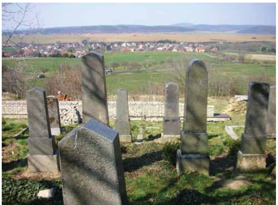
Hillside view from the country cemetery at Praskolesy, near Beroun.