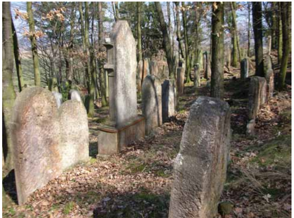
Above: Stones in the Běštín cemetery. Below: Běštín burial hall.

It seemed like a good idea at the time, so on 18 October 2009 I gave a presentation on how to use the census and produced a finding aid for it (3). In my talk, I explained that the 1793 census publication was in fact the publication of three separate censuses all done around the same period. Two were collected in Prague (1792 and 1794), and the